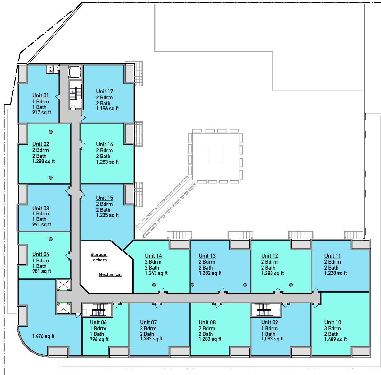
PHASE I - FLOORS 4 THRU 5